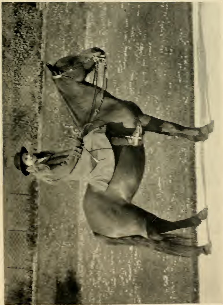
A YOUTHPFUL FOLLOWER OF THE PACIFIC